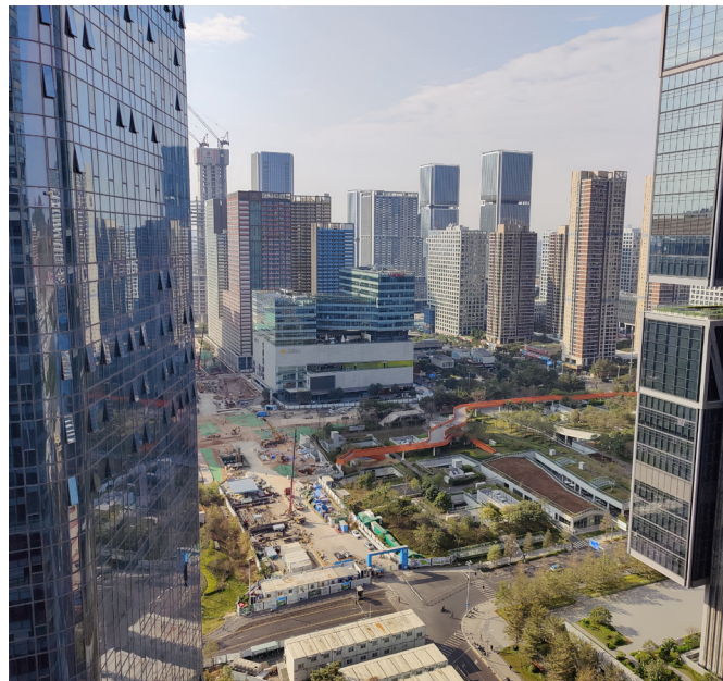
Buildings under construction on the outskirts of Shenzhen.

With the extreme pessimism currently surrounding China, it is easy to forget that it has achieved a very high level of economic growth and is now a middle-income country, with GDP per capita of USD13,000 compared to Brazil at USD9,400 or India at USD2,400 2 . Historically, this level has been challenging to surpass and many emerging countries have fallen into what has been termed the ‘middle-income trap’, where such countries fail to reach developed markets status. South Korea and Singapore are two notable exceptions. However, most countries don’t have adequate institutions, resources and stability, as well as a suitable political environment, to successfully implement the reforms needed for continued development. Our trip highlighted that China is positioned exactly at this crossroads and continued economic growth will depend on the path chosen by the leadership.