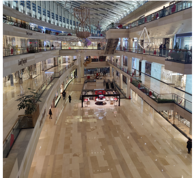
An empty high-end shopping mall in Beijing.

On the topic of geopolitics, several people we met described their sadness at the deterioration of the relationship between their country and the US, the latter of which was seen as aspirational by many. It is clear that China's current leadership is willing to take a more confrontational approach, despite being aware of its dependence on the West.