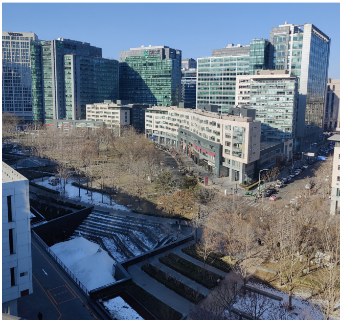
The urban skyline of Beijing.

With the extreme pessimism currently surrounding China, it is easy to forget that it has achieved a very high level of economic growth and is now a middle-income country, with GDP per capita of USD13,000 compared to Brazil at USD9,400 or India at USD2,400 2 . Historically, this level has been challenging to surpass and many emerging countries have fallen into what has been termed the ‘middle-income trap’, where such countries fail to reach developed markets status. South Korea and Singapore are two notable exceptions. However, most countries don’t have adequate institutions, resources and stability, as well as a suitable political environment, to successfully implement the reforms needed for continued development. Our trip highlighted that China is positioned exactly at this crossroads and continued economic growth will depend on the path chosen by the leadership.