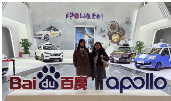
Baidu's self-driving robotaxi service, Apollo Go.

Our meetings with property companies painted a challenging picture in the short term. There is still significant property inventory to digest, the natural demand coming from urbanisation is slowing, and the price weakness of the past few years means that it will take several years for investors to return to property as an investment.