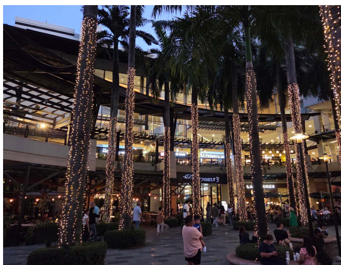
Filipinos enjoying shopping the night away.

“With limited positive exposure to the AI theme, the Philippines has been one of the worst performing equity markets globally over the past year, with a flat USD return compared to 30% for the MSCI EM Index.”