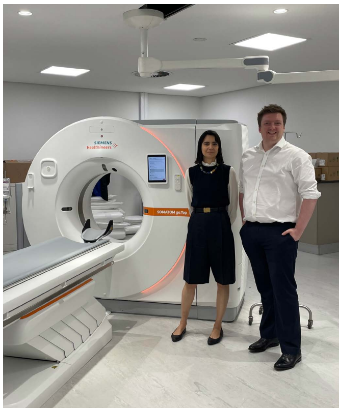
Visiting a privately-run hospital in Johannesburg.

After an early breakfast meeting to discuss the finer points of the country's insurance market, we kick off our final day with a site visit to a privately-run hospital in Alberton, south Johannesburg. Healthcare continues to be a hot button topic in South Africa, with debates around National Health Insurance continuing to rage on against the backdrop of a sorely under-resourced public system. We are visiting an accredited Trauma 1 hospital that has the facilities to cope with the most difficult of medical circumstances.