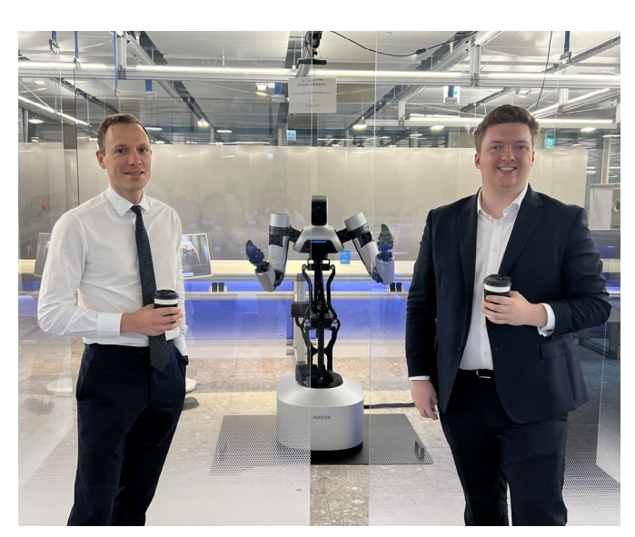
Robotic capabilities on display at a Korean technology company.

These meetings reinforced our belief that there are strong companies in Korea with durable franchises which are thinking about and acting on the interests of minority shareholders. Irrespective of whether Korea eventually achieves developed market status or not, we believe the efforts to get there will continue to drive an improvement in margins and returns within the country's equity market. We have already seen one example of improving corporate governance in the country through increased dividend payouts, as companies start to focus on minority shareholders' returns.