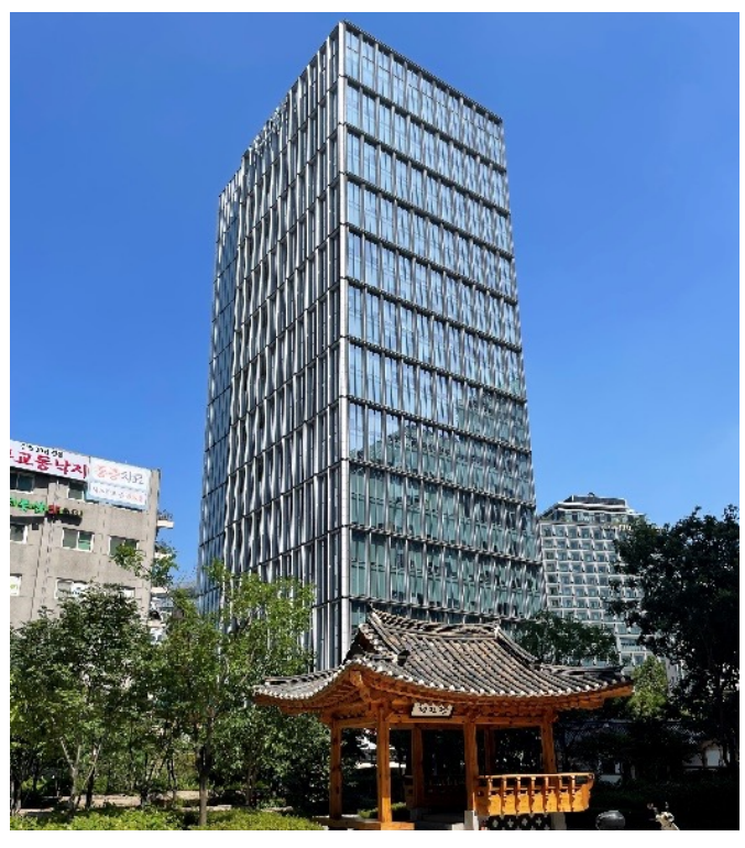
The modern and traditional sit side-by-side in central Seoul.

Reflecting on our trip, we continue to see the potential for long-term global winners to emerge from Korea. While selectivity remains vital in a country where corporate governance standards are still improving, Korea is home to a lot of companies that are positively exposed to the global growth themes that we look to gain exposure to in our portfolio. As such, we think that high hopes remain for the strongest players on the Korean field.