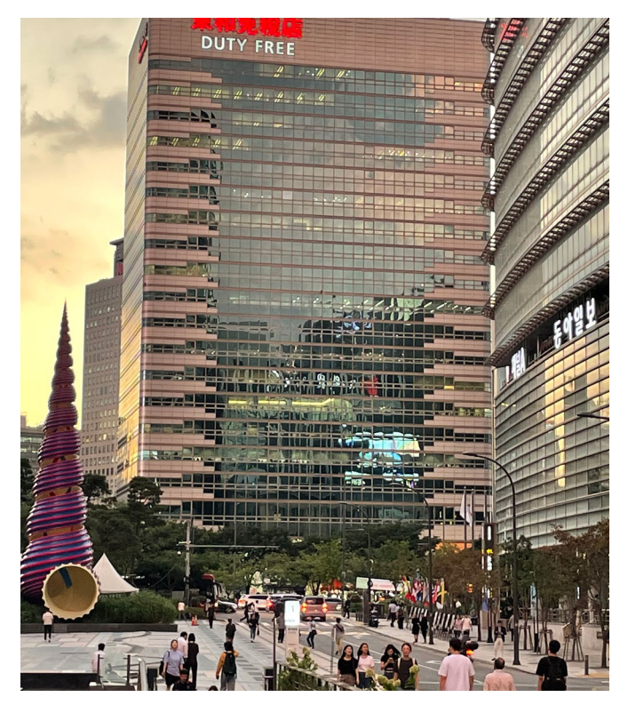
The dynamic city centre of Seoul.

Another structural growth area where we feel Korea has a real competitive advantage is Al. Korea has a heavy tech tilt, and we met various companies with exposure across the Al value chain. Semiconductors are one of Korea's main exports, along with autos and batteries, and Al is acting as a catalyst for memory heavyweights and portions of the tech supply chain after a particularly tough downcycle. The rewards are there for the companies that have been investing in innovation, capacity, talent, and their stakeholder relationships. We met a number of technology companies during our trip, undertaking facility tours, meeting management teams and speaking to companies about how they plan to sustain long-term durable advantages in the technology space.